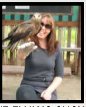
11h00 & 14h00 INTERACTIVE FLYING SHOWS

We fly a selection of owls, hawks, buzzards, kites & falcons <u>AROUND</u> and <u>TO</u> you.