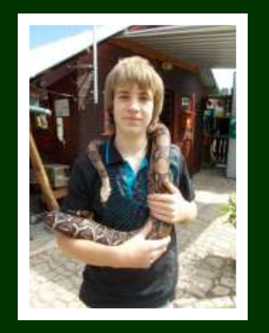
We have recently acquired a 3m long RED-TAILED BOA CONSTRICTOR, which you can wrap around your shoulders.

These are the daily hands-on activities that take place anytime throughout the day (ie: no set time). NO BOOKING NECESSARY .