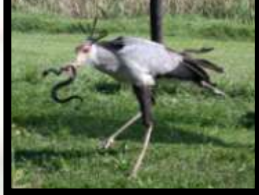
15h00 SECRETARY BIRD SNAKE HUNT

We simulate a snake hunt to demonstrate for you the deadly accuracy of the Secretary Bird's powerful kick.